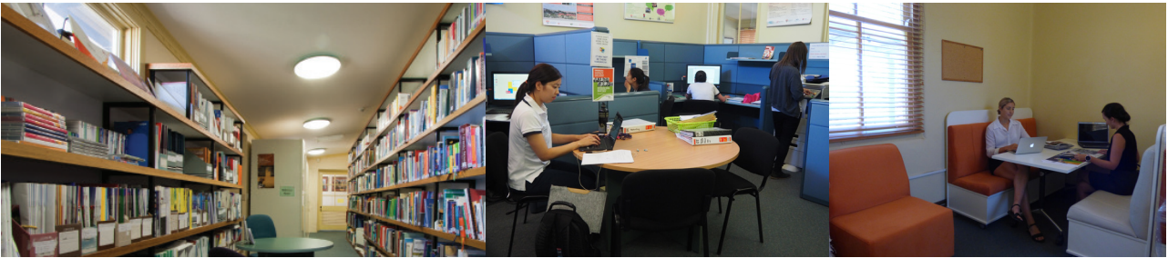
BHUDRH Library, Computer Lab and Library Hub