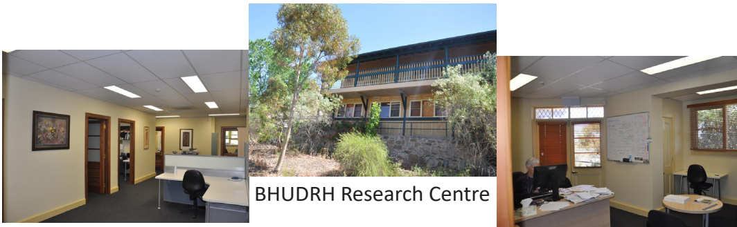
BHUDRH Research Centre